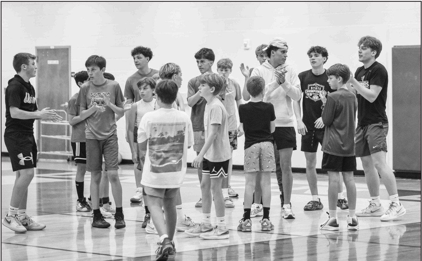
Members of the UCHS basketball team showing support for the youngsters during a youth camp earlier this month.

The Panthers defeated Strong Rock Christian Academy, Oconee County and West Hall. Union County lost to Habersham Central by 10-12