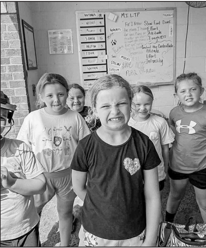
Taking a break from the heat inside the dugout.