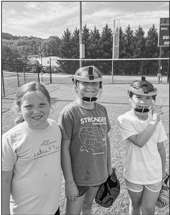
The Lady Panthers softball camp brought out 24 young softballers between the ages of 4-12.

The Class AA GHSA State Tournament gets underway on Oct. 16 after the brackets are finalized on Oct. 12.