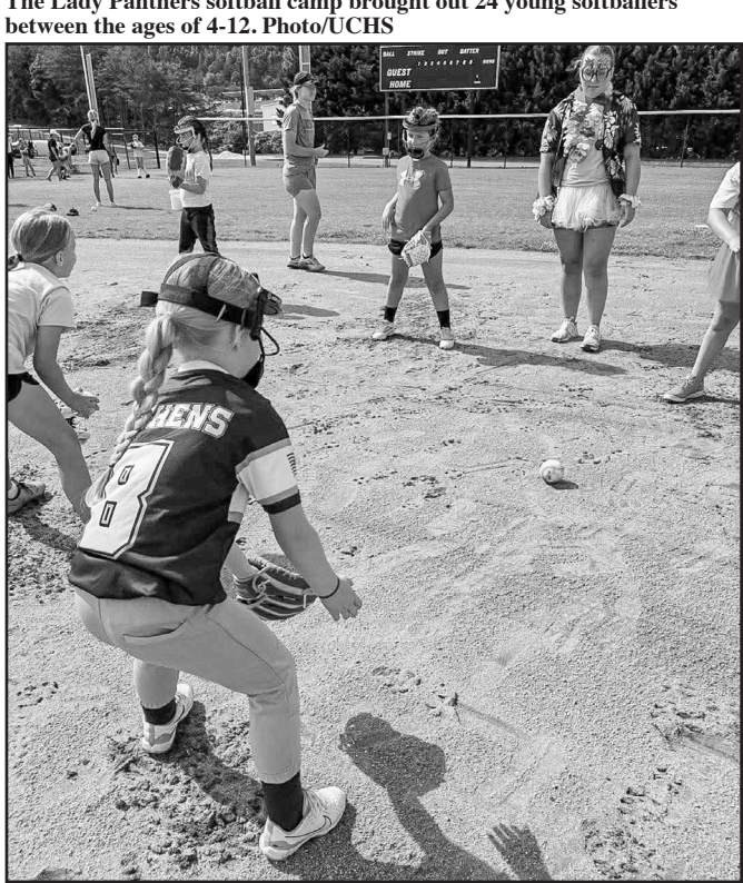
Campers work on infield drills at the UCHS softball field.